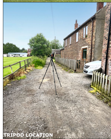
TYPE 1 PHOTOVIEW - EXISTING VIEW

To be viewed at a comfortable arm's length