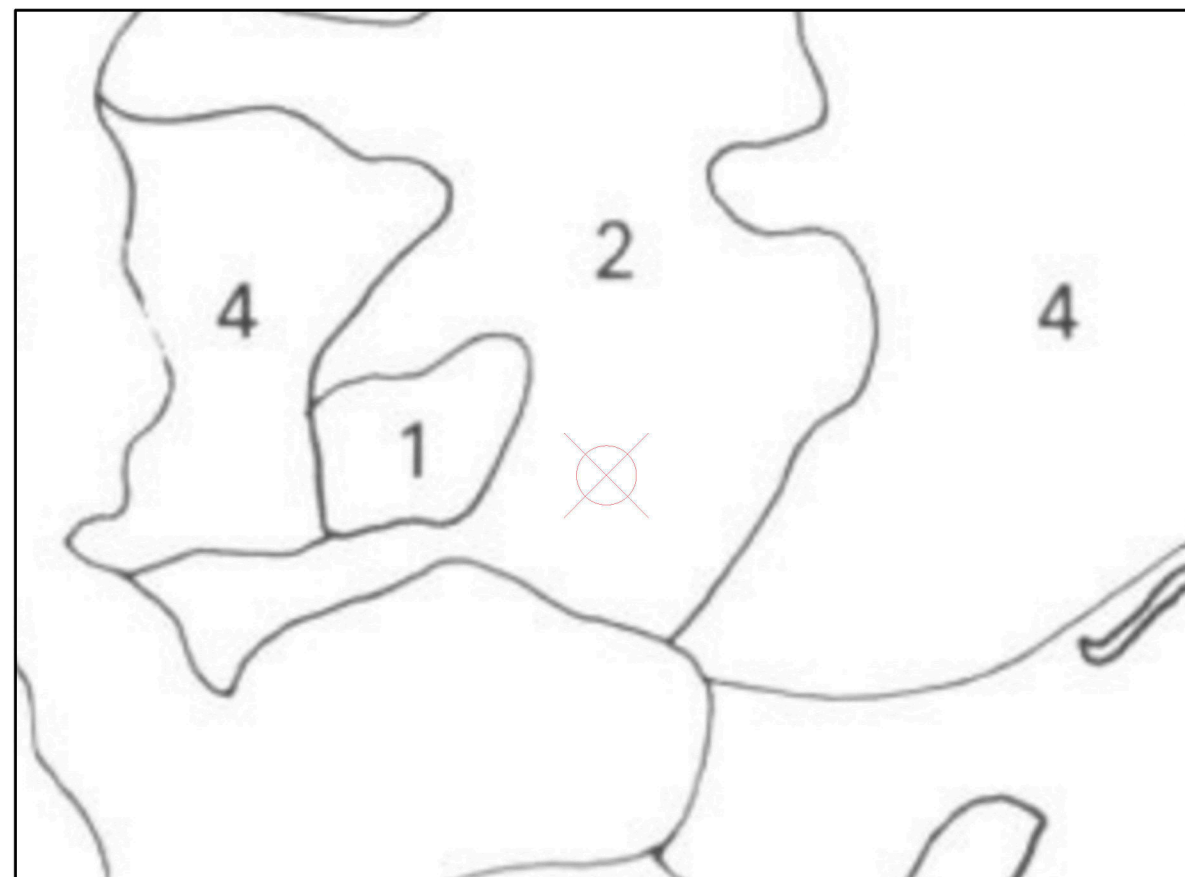
Winter Rain Acceptance Potential (WRAP)